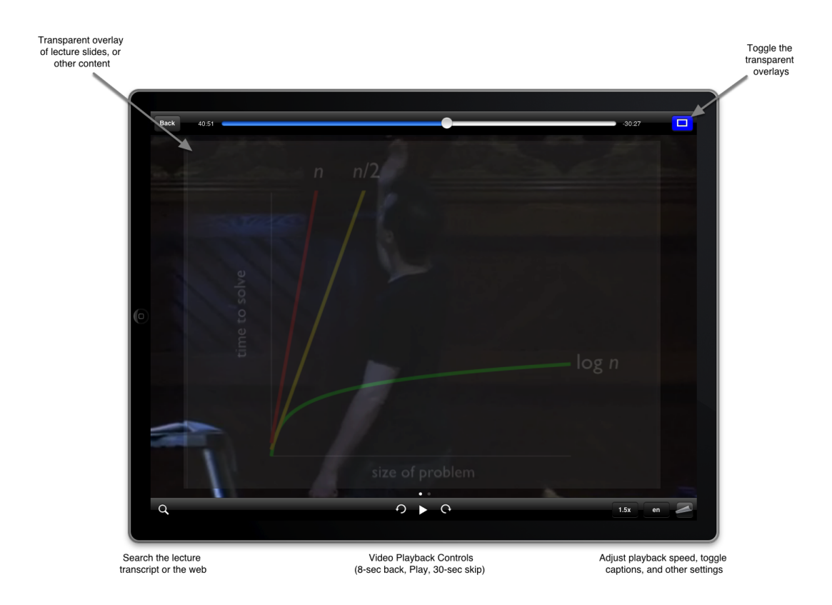
Figure 2: CS50 Video's iPad player offers an immersive experience in which students can view overlays with supplementary material as well as search transcripts and the web.

questions were recorded across 35 videos; 61.3% of these responses were correct answers. Although the semester is still in progress, we were disappointed with some of these early results, particularly the relatively low percentage (28%) of students who've engaged with CS50 Video's interactive assessments. Vis-à-vis alternative players, it is possible we overcorrected with CS50 Video's design, placing too much control in students' own hands, whereby it is now too easy to overlook available questions. At the same time, we suspect students might not perceive sufficient value in answering questions, given that responses are recorded but not graded for credit. We intend to experiment further with alternative interfaces that might lend themselves to more active engagement.